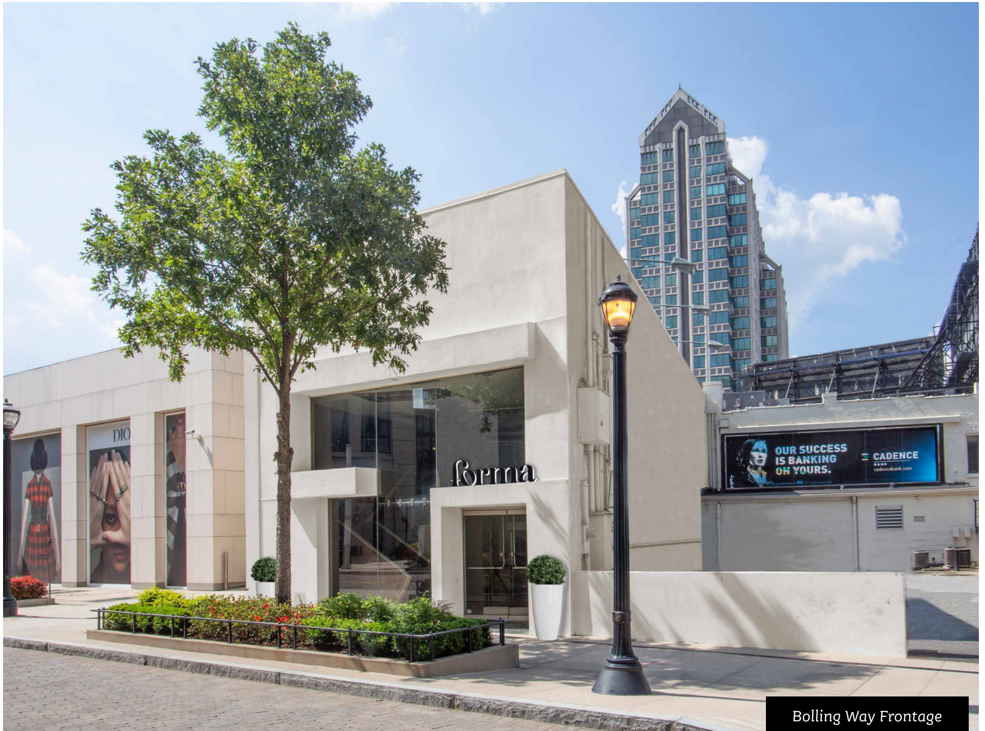
Bolling Way Frontage